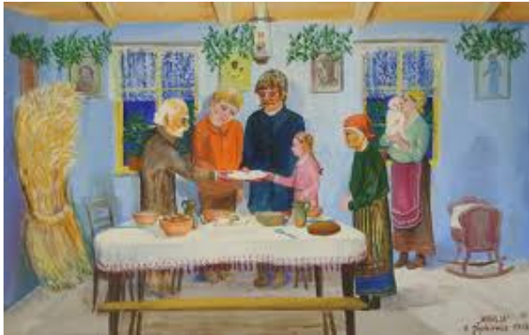
Illustration showing family sharing the Christmas wafer called Oplatek, in a traditional cottage setting with a sheaf of straw in the corner, one of the old Polish Christmas traditions.

This year has certainly flown by and did you get to see any of the Sunday Winter Films? There was a great line up. Next newsletter will be Jan/Feb 2013 so we wish Christmas Blessings to you, your family and friends