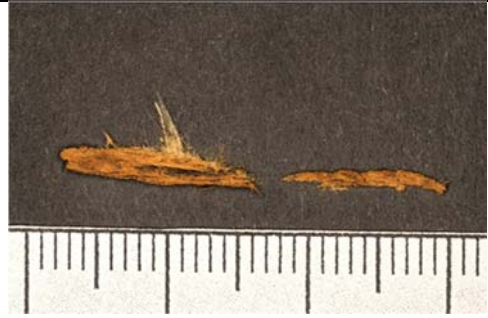
B) Rendering mode: Diffuse Gain