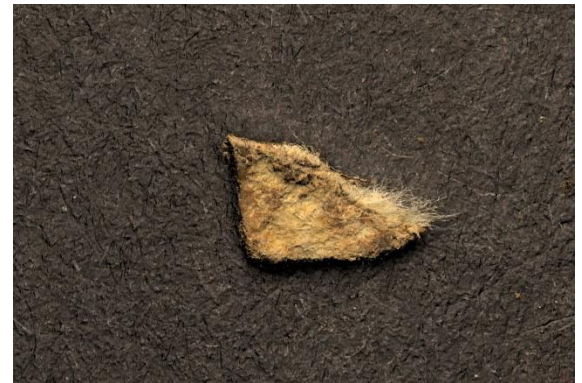
B) Rendering mode: Diffuse Gain