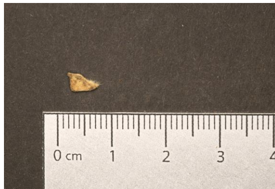
A) Rendering mode: Default