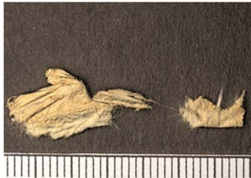
B) Rendering mode: Diffuse Gain