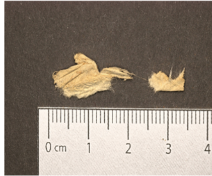
A) Rendering mode: Default