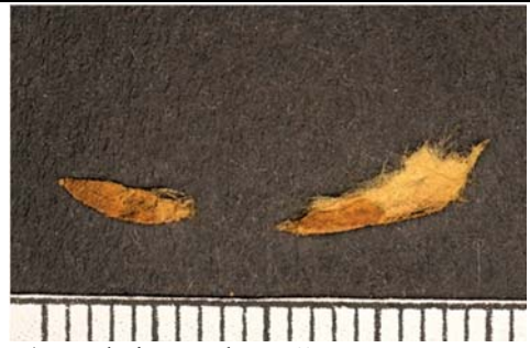
B) Rendering mode: Diffuse Gain