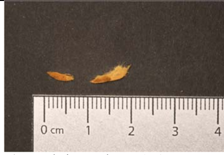
A) Rendering mode: Default