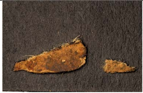
B) Rendering mode: Diffuse Gain