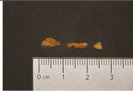
A) Rendering mode: Default