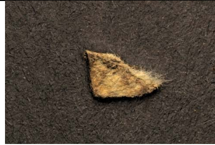
B) Rendering mode: Diffuse Gain