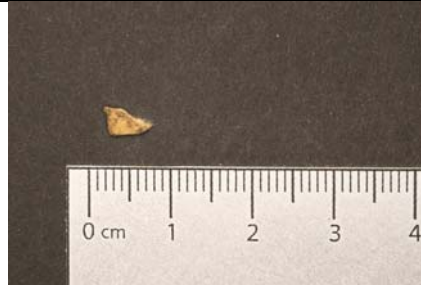
A) Rendering mode: Default