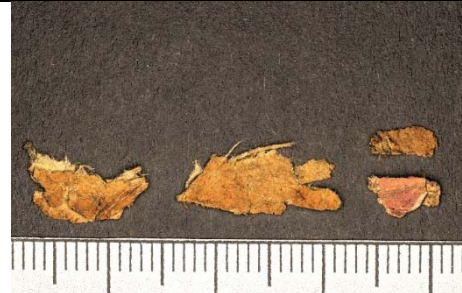
B) Rendering mode: Diffuse Gain