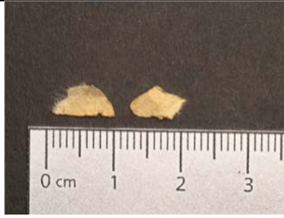
A) Rendering mode: Default