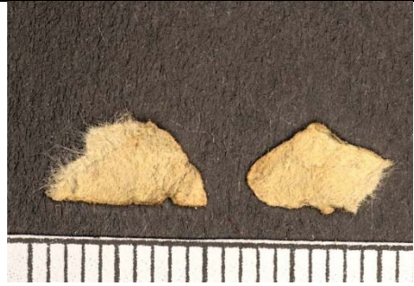
B) Rendering mode: Diffuse Gain